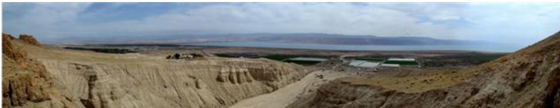
Panorama Photograph & other photo by Chuck Louviere